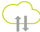
Real-Time SOC Compliance