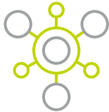
Explainable AI Models