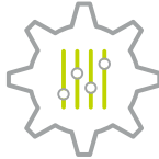
Customized to Your Business